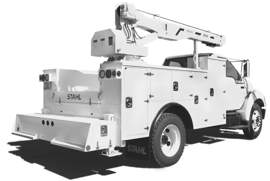
Shown with optional crane, bumper and manual outriggers.